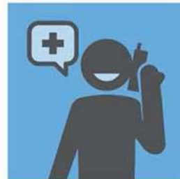
CALL BEFORE VISITING YOUR DOCTOR