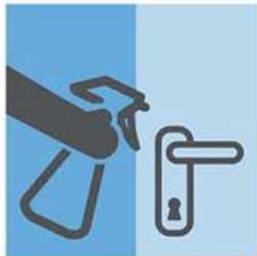
CLEAN AND DISINFECT "HIGH-TOUCH" SURFACES OFTEN