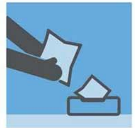
DRY HANDS WITH A CLEAN TOWEL OR AIR DRY YOUR HANDS