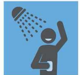
PRACTICE GOOD HYGIENE HABITS

For more information, visit: coronavirus.ohio.gov