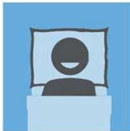
GET ADEQUATE SLEEP AND EAT WELL-BALANCED MEALS