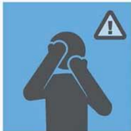
AVOID TOUCHING YOUR EYES, NOSE, OR MOUTH WITH UNWASHED HANDS OR AFTER TOUCHING SURFACES