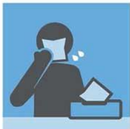
COVER YOUR MOUTH WITH A TISSUE OR SLEEVE WHEN COUGHING OR SNEEZING