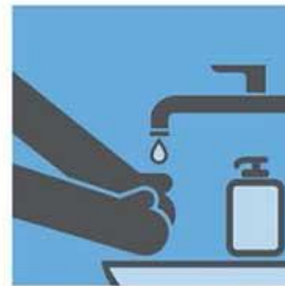
WASH HANDS OFTEN WITH WATER AND SOAP (20 SECONDS OR LONGER)